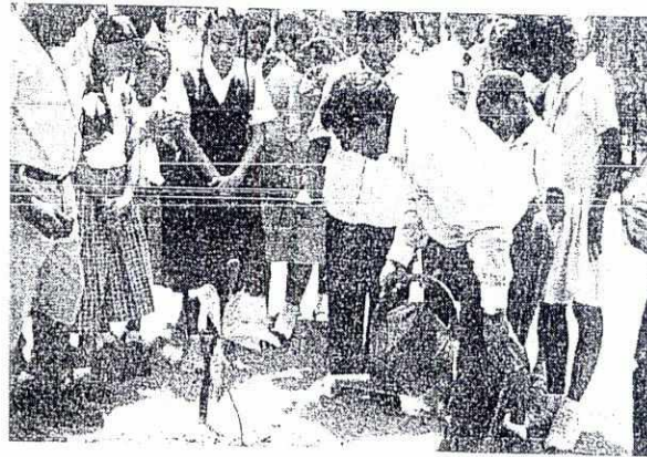
Minister Sheik Baksh planting a tree with school kids to mark World Biodiversity Day May 22 2009

This has been addressed in a number of ways; through the recognition of environmental days, where public figures are invited to plant a tree with school kids; through television programs; On March 3 2009 appeared on the Guyana Today Show- NCN to highlight the activities of the National Park and sensitize the public to the vision of the Commission