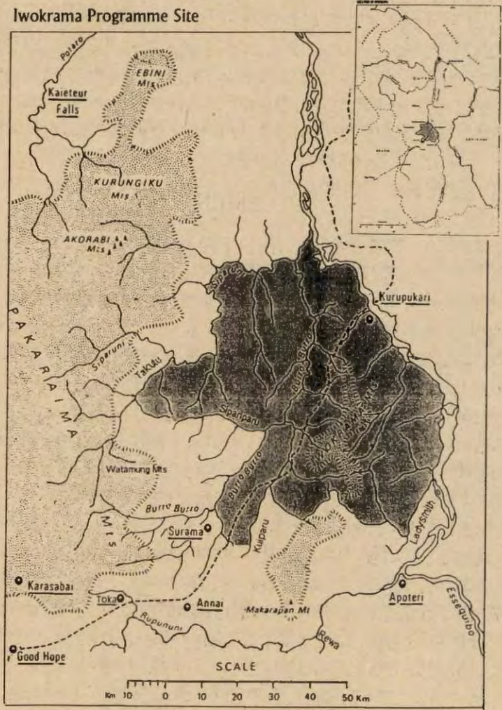
Iwokrama Programme Site