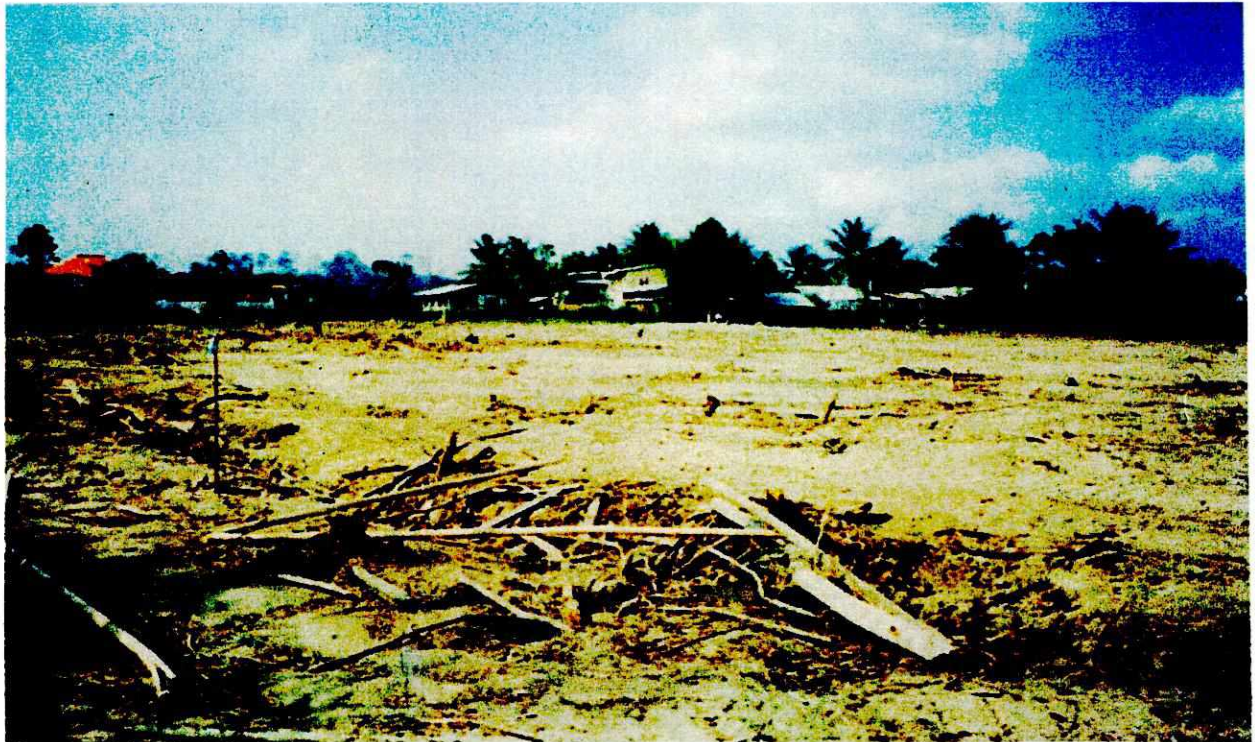
LAND OF CANAAN, EAST BANK DEMERARA WAS GRADED AND DRAINED THEN SURVEYED FOR HOUSE LOT